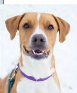
Ruby - 232 days