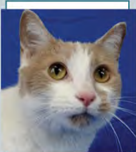
Rosie - 646 days