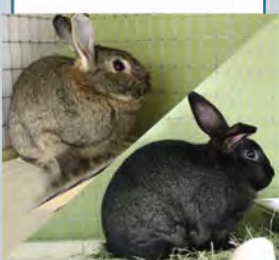
Winks & Mackey - 89 days (bonded pair) need to be adopted together