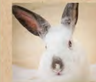
Birdie - Adopted 03/08/18