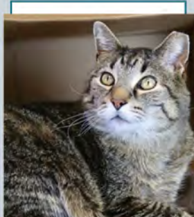
Tucker - 138 days