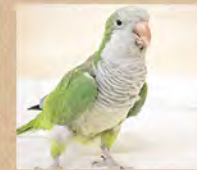
Poopsie - Adopted 05/01/18