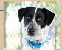
Bandit - Adopted 03/11/18