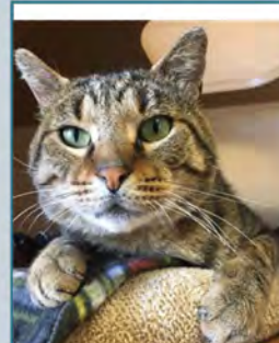
Pat - 132 days