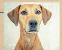
Lita - Adopted 03/23/18