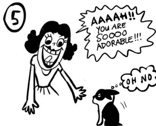
DON'T Squeal or shout in his face