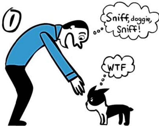
DON'T Lean over the dog & stick your hand in his face

I don't care how cute you (or your kid) think Boogie is. Please show him some respect.