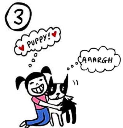
DON'T Grab or Hug him