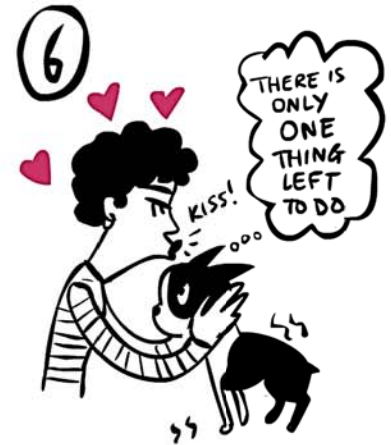
DON'T Grab his head and kiss it (This is an invasion of space)

Doing this to a dog who doesn't know you is like a perfect stranger giving you a great big hug and kiss in an elevator. Wouldn't that creep you out? And wouldn't you have the right to defend yourself?