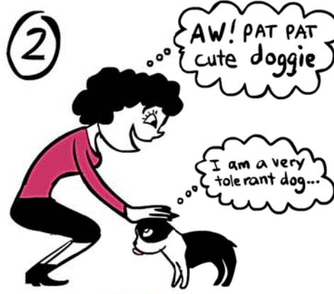
DON'T Lean over the dog & stick your hand on top of his head