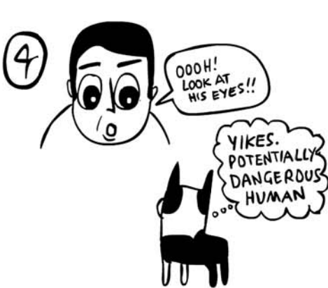
DON'T Stare him in the eye (This is an adversarial gesture)